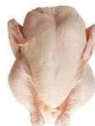
WHOLE HENS - NAKED & IWP