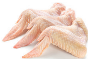
3 JOINT WING