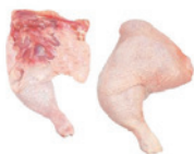
LEG QUARTER - HEAVY & LIGHT