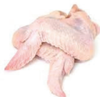
WING - HEAVY & LIGHT