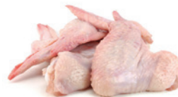
3 JOINT WING