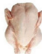
WHOLE HENS - NAKED & IWP