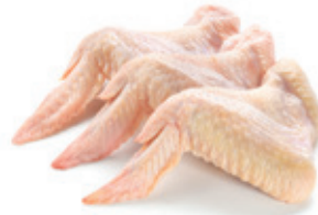
3 JOINT WING