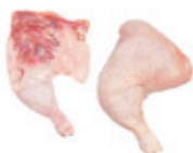
LEG QUARTER - HEAVY & LIGHT