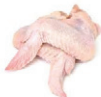
WING - HEAVY & LIGHT