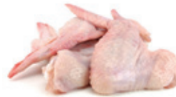
3 JOINT WING