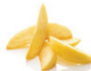
WEDGES WITH SKIN